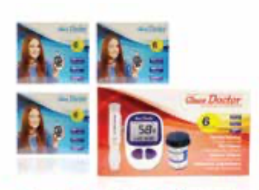
For Accurate And Reliable Results Trust Your Gluco Doctor